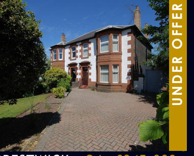
PRESTWICK - 0/o £245,000