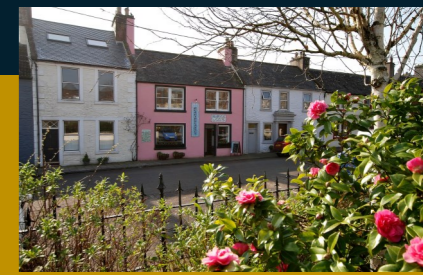
READINGGLASSES, WIGTOWN O/o £375,000