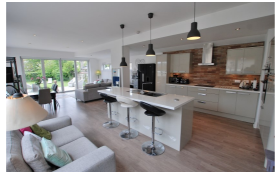
PRESTWICK AVAILABLE SOON