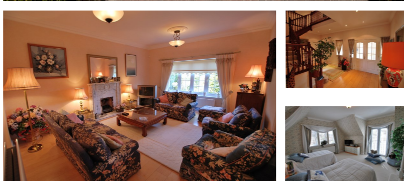
ALLOWAY, SHANTER WYND O/o £595,000