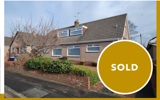
PRESTWICK O/o £185,000

We have been serving Clients ...since the 1930's, 40's, 50's, 60's, 70's, 80's, 90's, 00's, 10's, 20's blackhay.co.uk