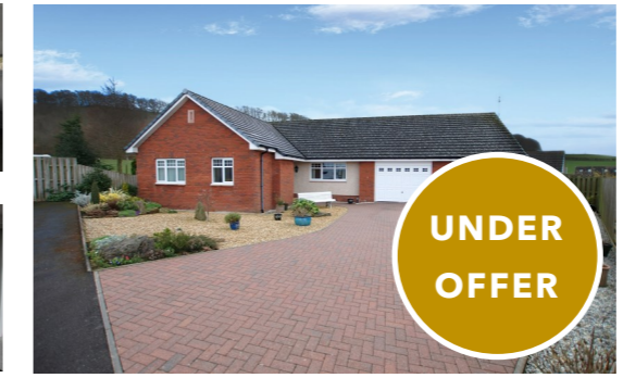
TORTHORWALD O/o £335,000