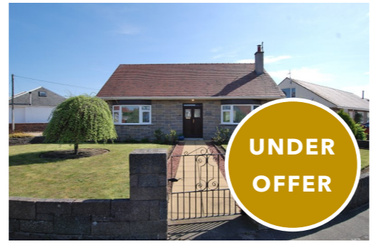
PRESTWICK O/o £285,000