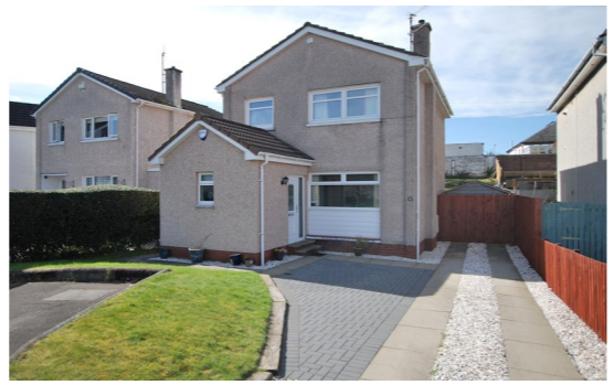
PRESTWICK O/o £255,000

The right time to Sell ? The right property, buyer & market allow us to negotiate some exceptional sale prices ...£50,000, £74,500, £80,000, £107,000 & £140,000 ...over the asking price. Just some of our BLACK HAY ESTATE AGENCY Property Sales. If it is your time to Sell, contact Graeme Lumsden, BLACK HAY ...over 35 Years as a successful Estate Agent ...across Scotland. blackhay.co.uk