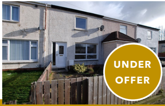
PRESTWICK F/p £104,950