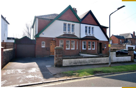
PRESTWICK O/o £325,000