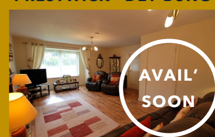
AYR RETIREMENT FLAT