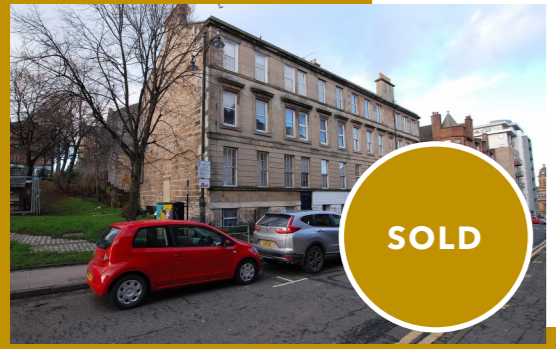
GLASGOW O/o £155,000