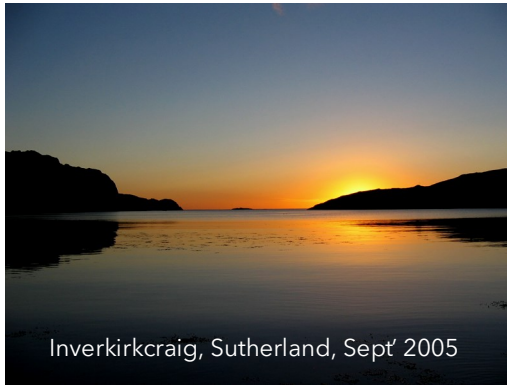
Inverkirkcraig, Sutherland, Sept' 2005